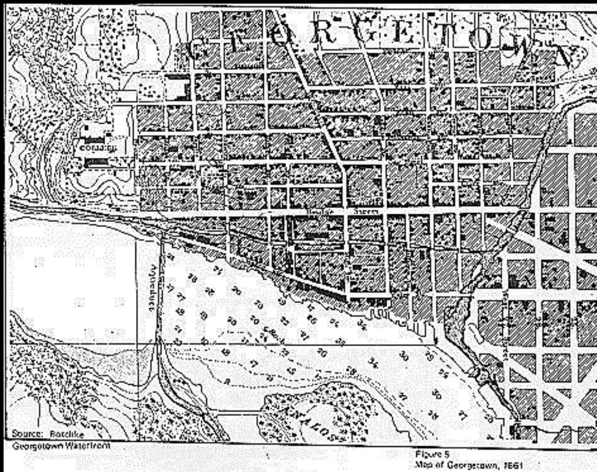
Figure 5 Map of Georgetown, 1861