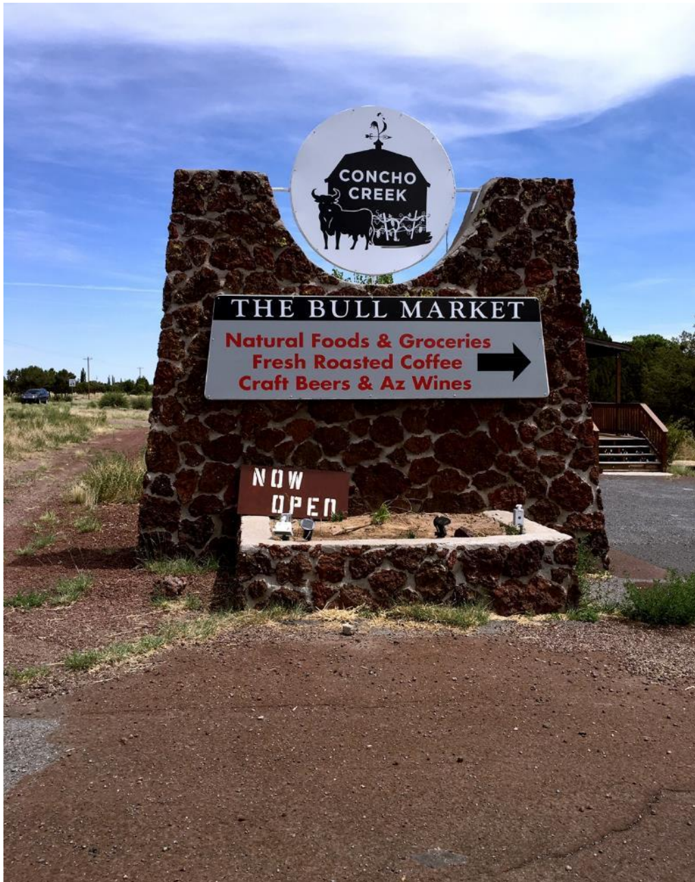
CONCHO CREEK, AZ/ VANDERBILT AVENUE, NYC