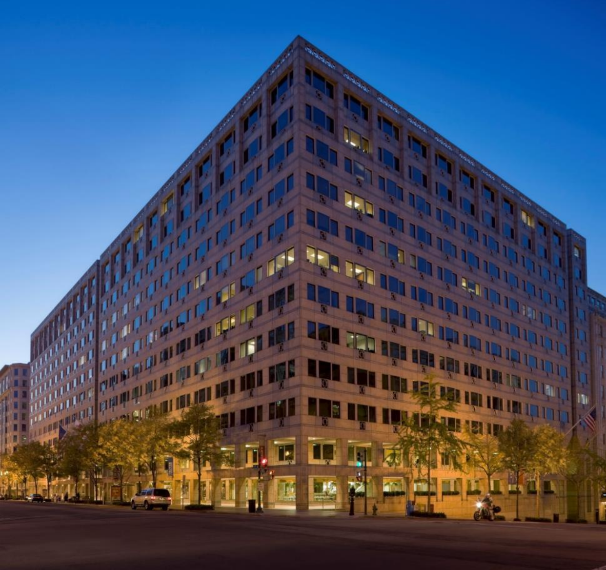
COLUMBIA SQUARE, Washington, DC Completed 1987