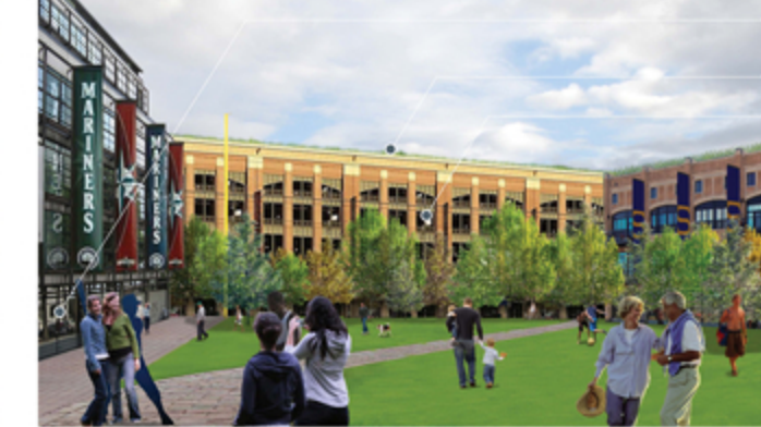
Scene D: Mt. Baker Station Plaza