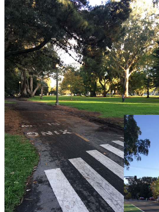
Panhandle bike path

Biking is also supported. I observed three "Go Bike" stations (electric-assist bikes available for short term rentals through an App) during my audit, as well as dedicated bike lines on several streets. The Panhandle is part of "the wiggle," which is the flattest route to downtown: critical for bike commuters to avoid the San Francisco hills! Lastly, my audit walk included a recent project that overhauled the busy street Masonic to include a median with trees and dedicated bike lanes.