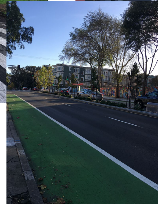
New bike lane on Masonic