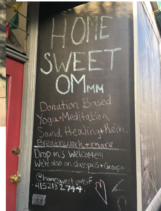
Yoga and Meditation